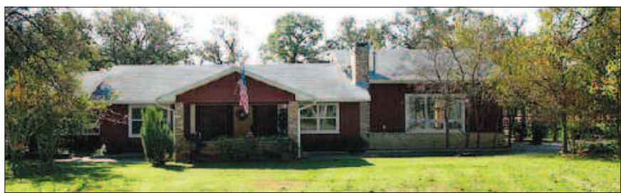
The property at 261 Hunter Court in Bartonville is priced at $2.2 million.

living space with three bedrooms and two baths. It is located in the Argyle school district.