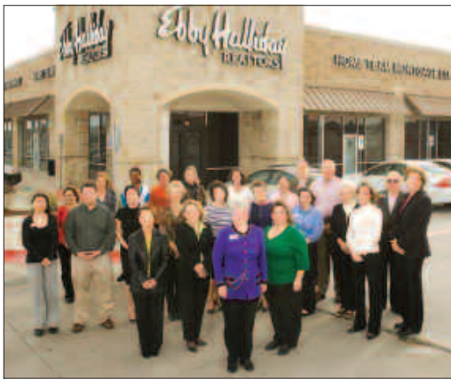
Pictured are staff members of Ebby Halliday Realtors' Tri-Counties office.