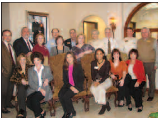
Pictured are the Top 10 agents for November and December 2007 at Ebby Halliday Realtors' Firewheel/190 office.